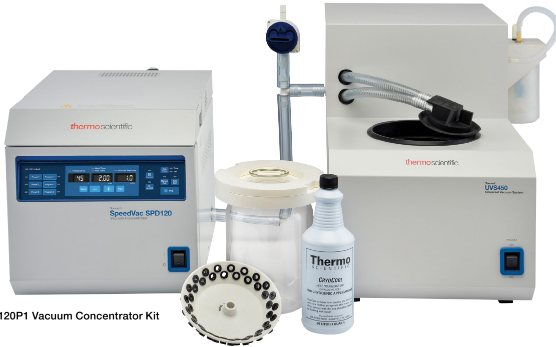
SpeedVac SPD120P1 Vacuum Concentrator Kit