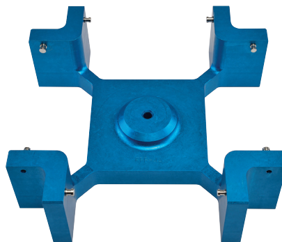
Savant FPR-4A Universal Plate