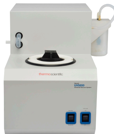
Savant UVS850DDA Universal Vacuum System