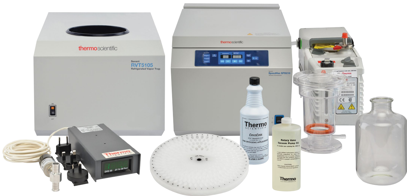
SpeedVac SPD210P1 Vacuum Concentrator Kit