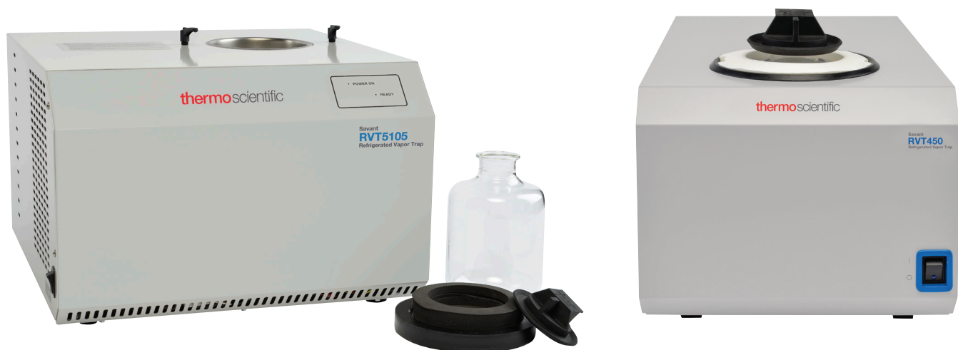
Savant RVT5105 Refrigerated Vapor Trap, Glass Condensation Flask and Flask Cap, disassembled