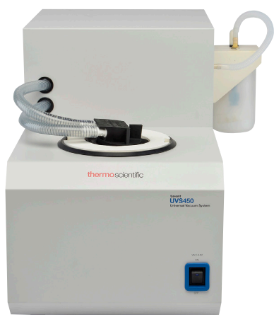
Savant UVS450 Universal Vacuum System