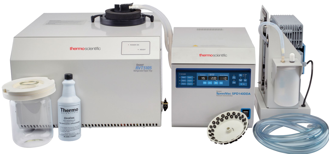
SpeedVac SPD140P1 Vacuum Concentrator Kit