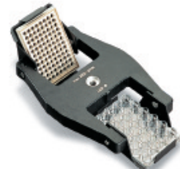
Microplate rotor 75008177