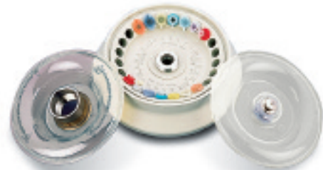
Fixed angle rotor for microliter tubes 75003325