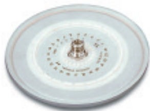
Haematocrit rotor 75008171 1)