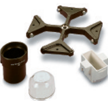
Swinging bucket rotor 75008179 with round bucket 75008172 (left), aerosol-tight cap 75008173 (middle) and cyto bucket 75008176 (right)