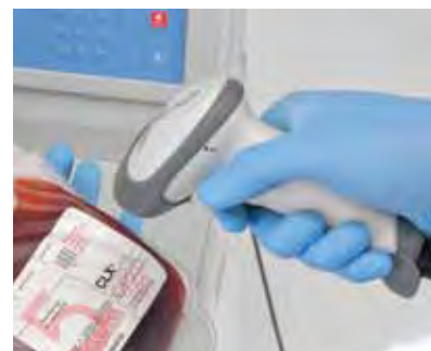
Accurate data and paperless process documentation with electronic bar code scanner