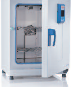
All Heratherm Advanced Protocol Security ovens are available in coated or stainless steel exterior.