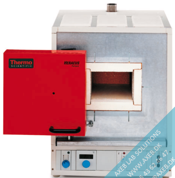
Thermo Scientific Heraeus M 110 Muffle Furnace Chamber volume: 9 l

AXEB LAB SOLUTIONS WWW.AXEB.DK +45 43 62 45 47 INFO@AXEB.DK