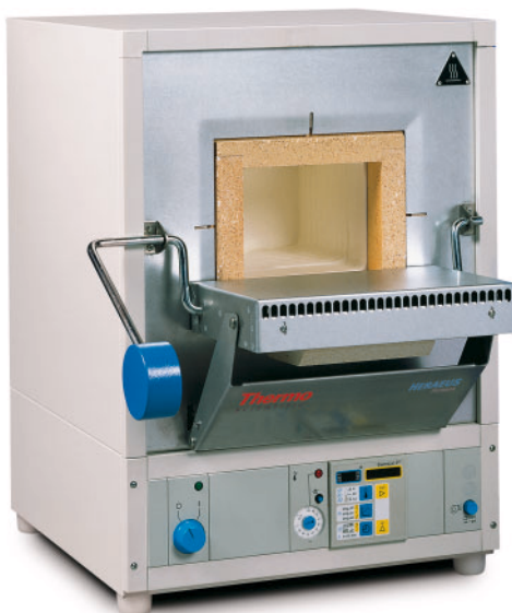
Thermo Scientific Heraeus M 104 Muffle Furnace Chamber volume: 3.5 l