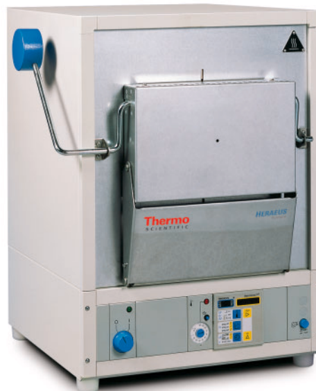
Thermo Scientific Heraeus K 114 Chamber Furnace Chamber volume: 3.5 l

AXEB LAB SOLUTIONS WWW.AXEB.DK +45 43 62 46 47 INFO@AXEB.DK