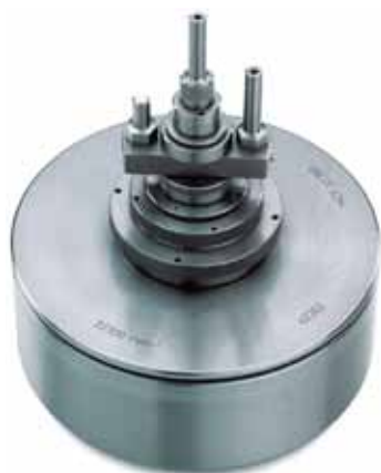
Figure 2. Thermo Scientific Contifuge Stratos continuous flow rotor (catalog no. 75003049)