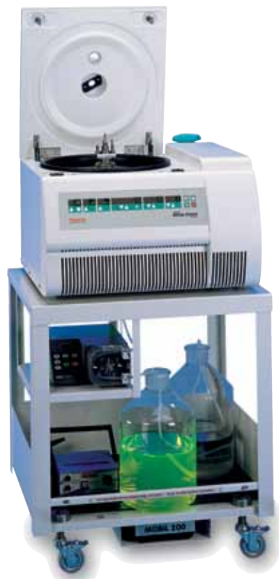
Figure 1. Thermo Scientific Contifuge Stratos and its continuous flow rotor (catalog no. 75003049) on cart with castors and pump secured in its compartment

E.coli cells were centrifuged using the Thermo Scientific Contifuge Stratos tabletop centrifuge. With the continuous flow rotor E.coli cells were spun at a speed of 16,000 rpm (22,161 xg) and at an operating temperature of 4 °C. The harvest flow rate was ~ 450 mL/min and the total working volume of the two fermenters harvested was 18 L.